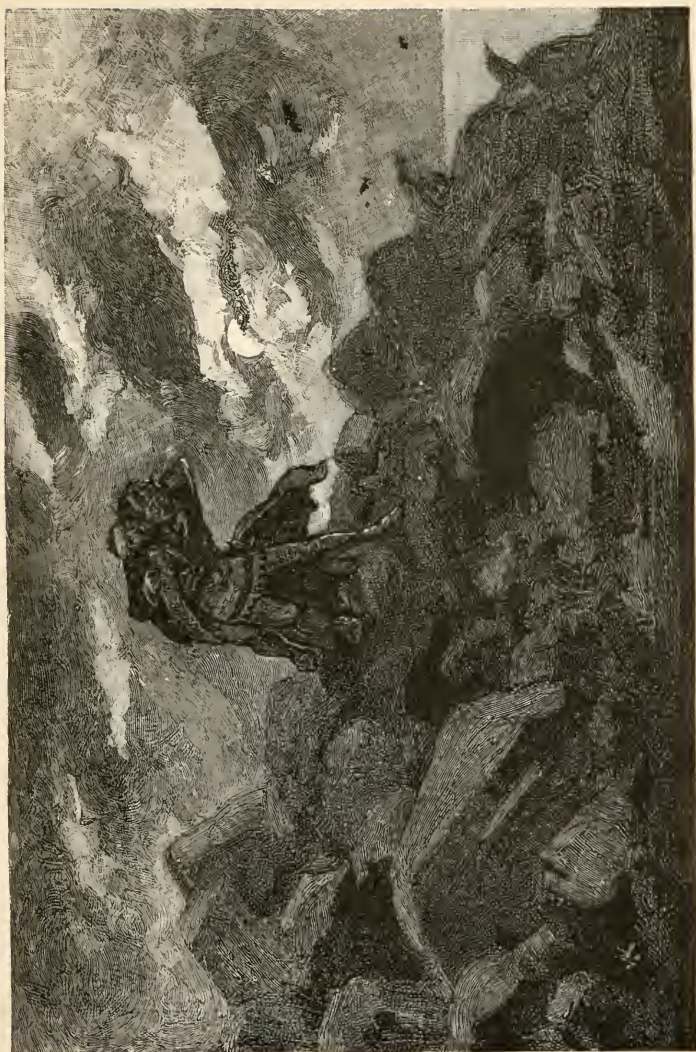
How Bedivere bare King Arthur to the Waterside.